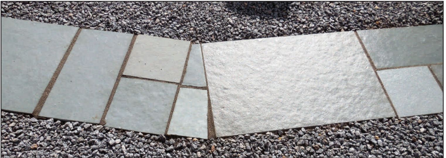
Left side of photo is Steel Blue without sealer and the right side of photo is with sealer

Both Golden Fossil and Steel Blue can be laid over existing concrete or set on a bed of 3/8" stone, recycled concrete fines or crushed coquina that has been leveled and tamped. Once stone is put in place fill the joints with Polymeric Sand or 3/8" Gravel to give your job a finished look.