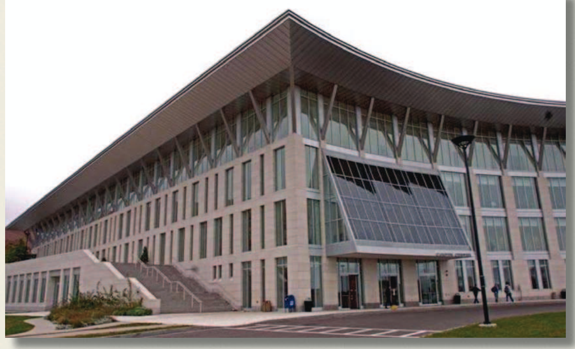
University of Massachusetts Student Center Color: Dovewhite Emissivity: 0.89 Solar Reflectance: 0.58 SRI: 68